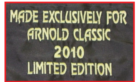
Inside Label ↑